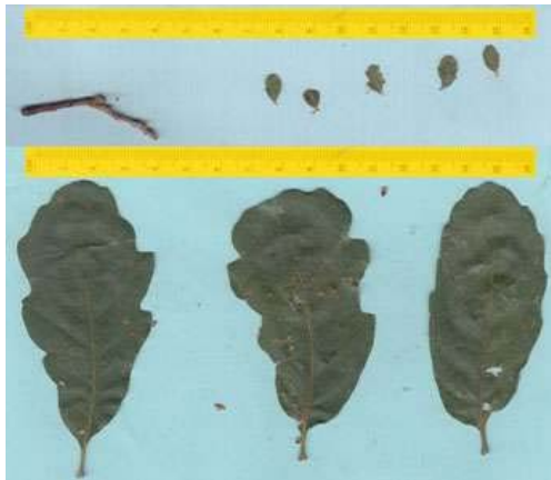
Severe drought caused blue oaks in the driest locations to grow fingernail-sized leaves (above) that were many times smaller than normal (below). All of the trees that produced tiny leaves died.

Oaks weren't alone in their travails. California has accumulated more than 100 million dead trees since 2010 .