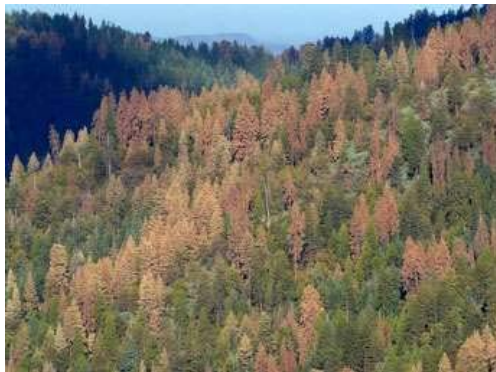
The 2012-2015 California drought has killed an estimated 100 million trees to date.

That's because the underlying geology determines the amount of water available to plants. Trees growing high on hillslopes might have less access to water than trees growing over groundwater that might have accumulated in, for example, sandy aquifers below stream channels.