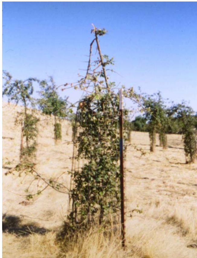
Figure 3. Vaca cages used to protect direct-seeded valley oaks from seasonal cattle grazing.

In areas where livestock grazing cannot be eliminated or adequately restricted, it is still possible to protect individual oak seedlings or saplings from browsing by using single tree exclosures. Individual exclosures must be relatively sturdy to withstand the abuse of cattle that pull at protruding oak branches and rub against the exclosures. For the past 10 years, we have successfully used a low-cost single-plant exclosure of our own design (Vaca cage) to protect both existing oak saplings and new planting sites from cattle (Swiecki and Bernhardt 1997, Figure 3). Vaca cages have been effective in protecting individual oaks or planting sites from cattle (Table 1, Figure 2). Periodic inspection, repair, and height adjustment is necessary to maintain the cages' effectiveness. Cages must eventually be removed to prevent girdling and scarring of oak branches by cage wires.